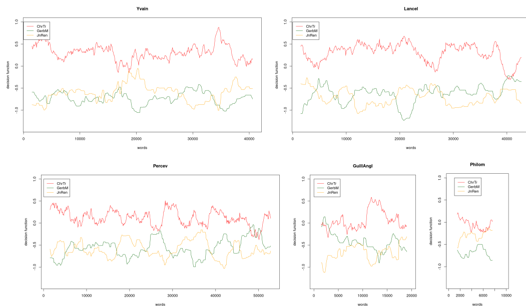
Figure 2: Rolling SVM analyses of all texts unseen in training

signature at the end of Lancelot , roughly from word 38 200 in our analysis, which matches the verse 6156 in our edition (“ Mes de Lancelot n’i voi mie ”). This is quite coherent with both the stylistic expertise of James-Raoul (2007) and the quantitative analysis of Reilly and Dillon (2013), who posit a transition from Chrétien de Troyes to Godefroi de Leigni around verse 6150.