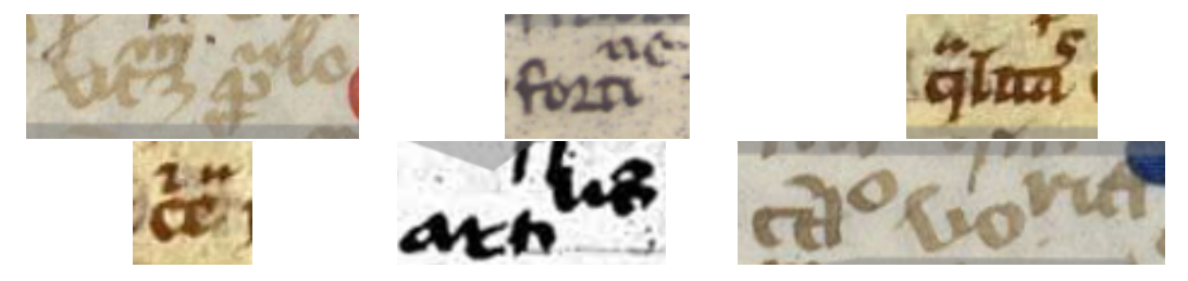
Figure 1: Examples of contraction use of superscript letters. Manuscripts in the following order: BIS193, CML13027, Montpelier H-318, Montpelier H-318, BAV Pal. lat. 373, BIS193.

Superscripts letters and interlinear additions A standard way of contracting a word is by adding a superscript letter which gives information about the abbreviated sequence. Frequent ones are open a, u, o, or the ending of a word altogether. These were all rendered with the aid of superscript characters(Pinche, 2022b, p. 11). Ergo and igitur are two of the most frequent example of abbreviations with superscript letters. Letters without any baseline letter are simply represented with the same combining superscript character and space as the supporting baseline character (e.g. "a": space + combining a + space + combining t).